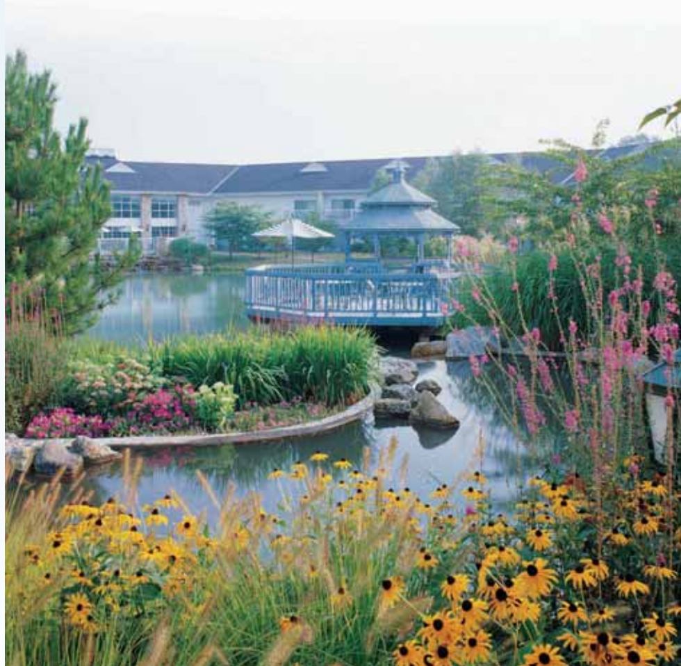
Cherry Valley Lodge is a favorite spot for weddings thanks to its beautiful arboretum and botanical garden.

Staff retention programs or in-service programs: We hold in-service programs weekly for our guards to maintain their skills