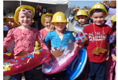
Y Preschool children with their floatation devices enjoy ground breaking.

After the ceremony, YMCA Board of Directors and staff welcomed volunteers, donors, key community leaders and the public to a special lunch provided by Horizon Construction our design/build construction manager. YMCA staff provided homemade desserts and gave tours of the existing YMCA to those who were interested.