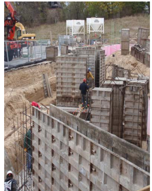
Contractors set forms for basement walls and foundations.