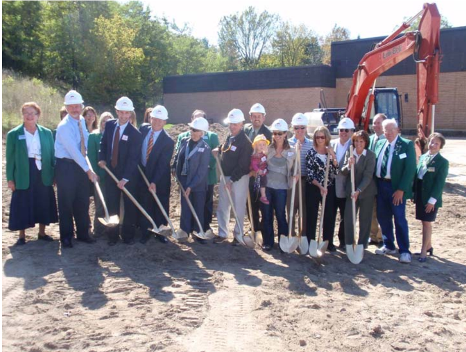
On October 6 th the Kettle Moraine YMCA officially broke ground on the new Family Adventure Pool. Construction timeline includes and opening date of summer 2011.