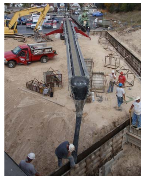
Conveyor belts are used to pour concrete for interior foundation walls.