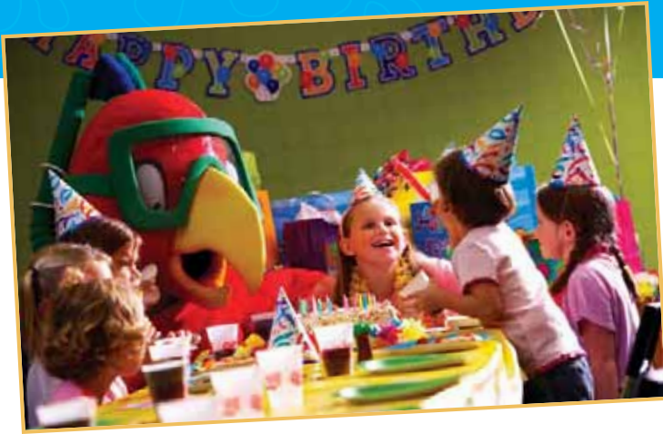
Birthday parties at CoCo Key are popular with all ages.

eight waterslides of varying sizes. Our goal was to create opportunities for kids ages 4 to 13 and keep them coming back several times a year, to explore new slides and activities. “Shark Slam” is a thrilling body slide with curves, “Gator Gush” is a full-speed splashing body slide with banked turns, and “Barracuda Blast” sends one or two people at a time, on a raft, through jaw-dropping curves. “Pelican’s Plunge” is the largest slide at 352 feet.