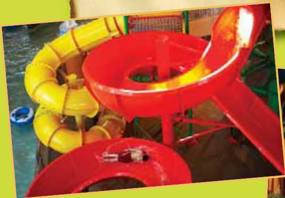
CoCo Key reflects Key West's tropical appeal.