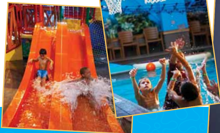
Guests enjoy a variety of activities at CoCo Key.

In Arlington Heights, in concert with the other resorts, the "CoCo Key" moniker, along with the décor and atmosphere, reflect Key West's tropical appeal. It's a laid back atmosphere, full of sunshine and a wel-